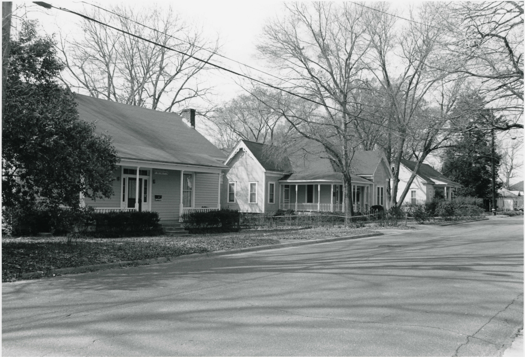
500 BLK. E. PILAR (SOUTH), STERNE-HOYA H.Q. NACOGDOCHES CO., TEXAS