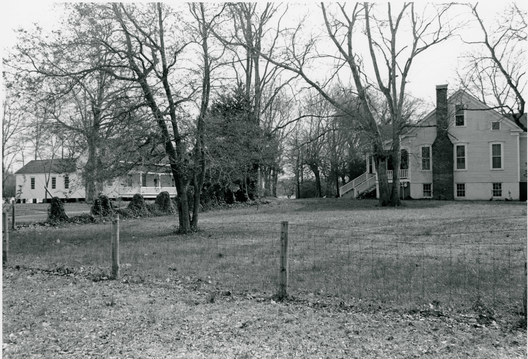
200 BLK. S. LANANA, STERNE-HOYA H.D. NACOGDOCHES CO., TEXAS 11 OF 30