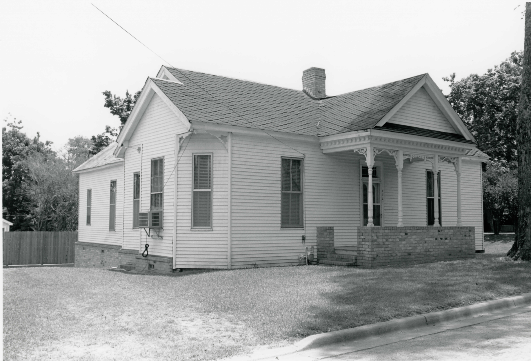
113 S. LANANA , STERNG-HOYA H.D. NACOGDOCHES CO., TEXAS 14 OF 30