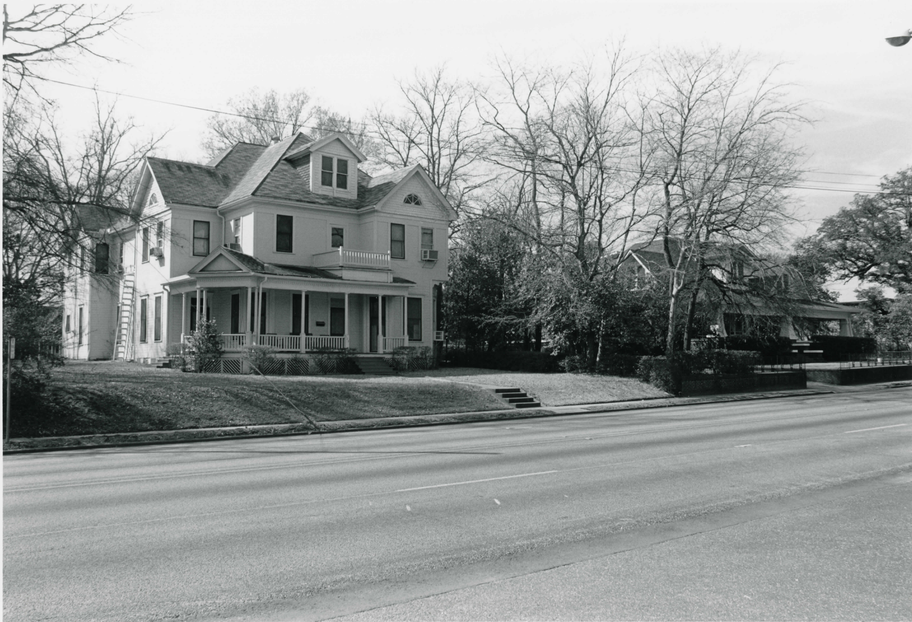
500 BLK. E. MAIN (SOUTH), STERNE-HOYA H.D. NACOGDOCHES CO., TEXAS 13 OF 30