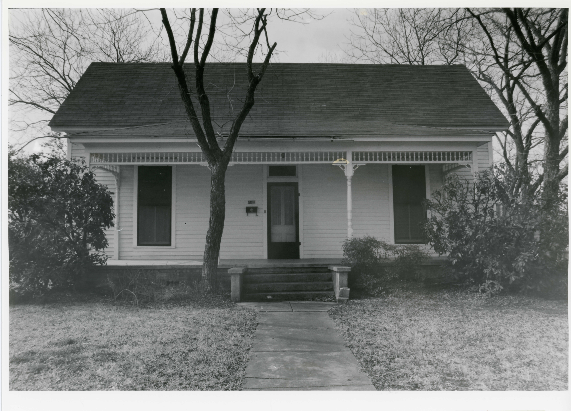
#418 440 N. PENELOPE