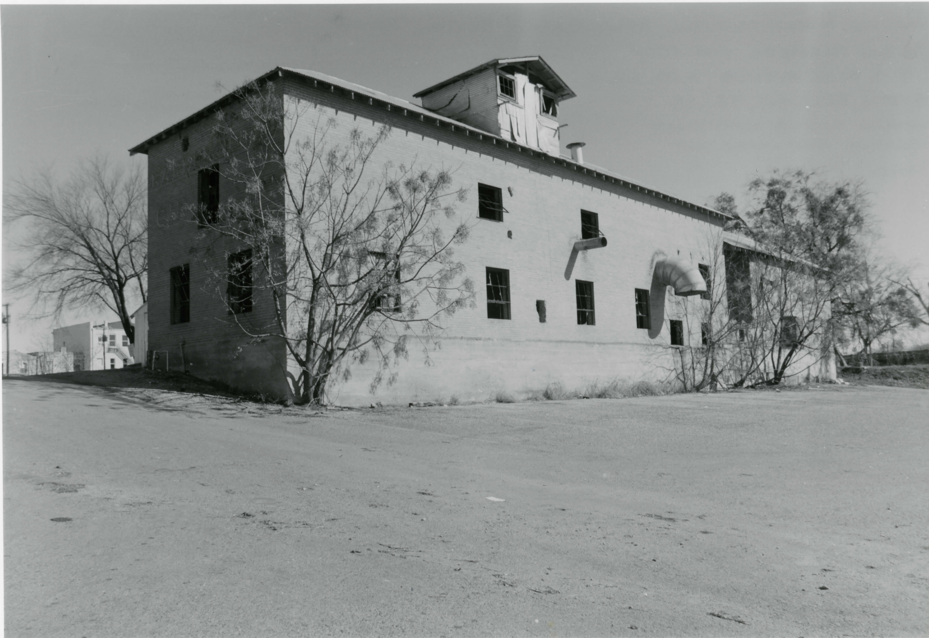
CBD-65 FARMERS COOP GIN