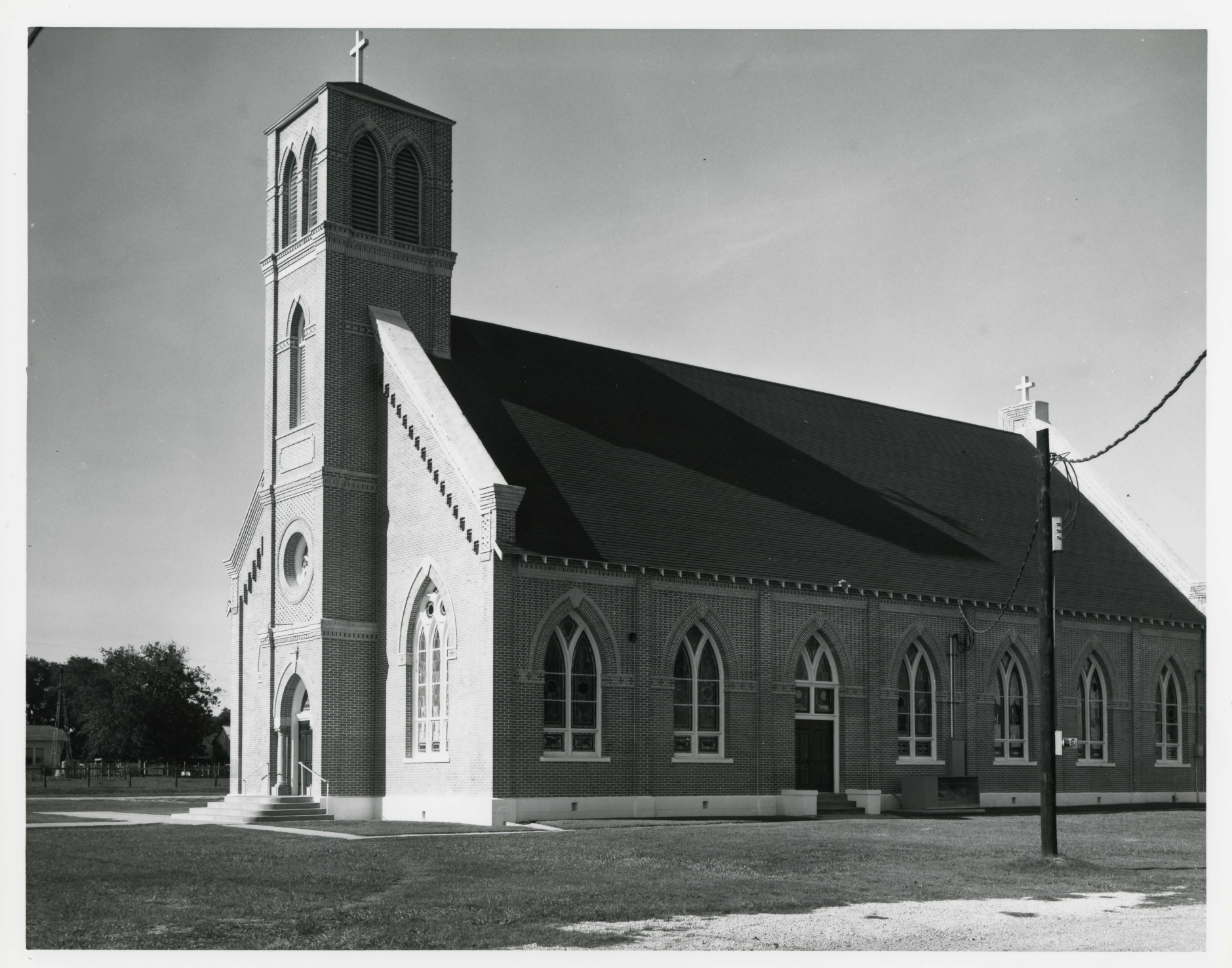
TEXAS HISTORICAL COMMISSION