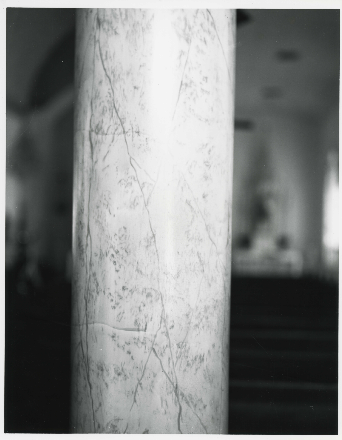
TEXAS HISTORICAL COMMISSION